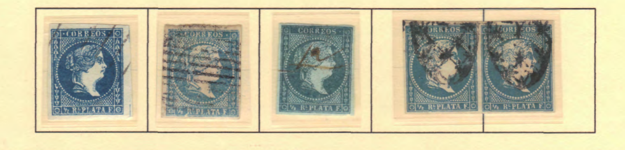
Heavy Blotches Eve + houth