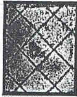
Wmk. 105- Crossed Lines