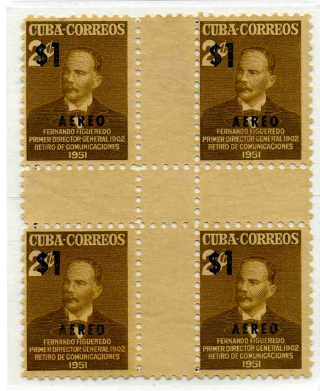
1 Peso over 2¢ airmail 250 sheets printed

Three quarters of the proceeds from the sale of these stamps was donated to fund the communications workers retirement program.