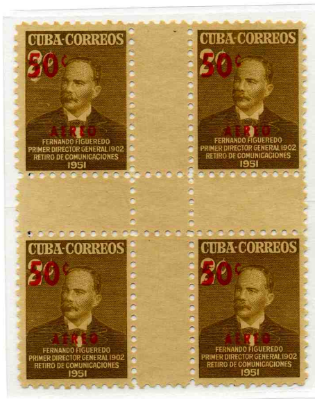
50¢ over 2¢ airmail 10,000 sheets printed