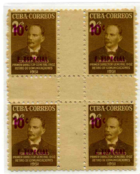
10¢ over 2¢ special delivery 4,000 sheets printed